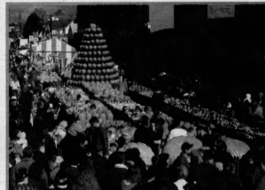
A VARIETY of pumpkins and other fall harvest produce will be displayed at the Circleville Pumpkin Show, being held Wednesday through Saturday.