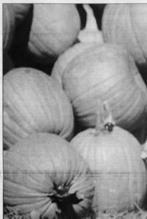
Pumpkins and various foods made with pumpkins are a big part of the focus of the Chillicothe Pumpkin Show today through Saturday.

By ANNE SCHNEIDER Gazette Staff Writer CHILICOTHE — Today through Saturday are likely the only times to buy pumpkins, carved pumpkins and other items in Chillicothe, Ohio. The 17th annual pumpkin show is being held at the Chillicothe Pumpkin Show as well. Pumpkins, gourds, corn, and other items for sale are available at the show. Pumpkins are available for sale at the show. Pumpkins are available for sale at the show. Pumpkins are available for sale at the show. Thursday 8 p.m. — Parade of high school bands 9 p.m. — First parade 10 p.m. — Parade of civic and fraternal organizations Friday 10:30 a.m. — Parade on parade ground 5:30 p.m. — Bag calling contest 6:30 p.m. — Address contest 7 p.m. — Annapolis Community Band and the River Valley Band 8 p.m. — Queen's Parade The Chillicothe Transit System and the Community Center are sponsoring a parade on the main street in Chillicothe on the show. There will be three runs each day at 7 p.m., 8 p.m. and 9 p.m. on Wednesday through Saturday. The show will begin at the Chillicothe Transit System Center at 14th E. Water St., go to the Municipal Parking Lot at Railroad and Water streets, then to the Central Center and E. Perry in Chillicothe Mall. It will then go to Chillicothe to return to Chillicothe Mall at 8 p.m. on Oct. 21. The parade will start at 8 p.m. on Oct. 21. The parade will start at 8 p.m. on Oct. 21. The parade will start at 8 p.m. on Oct. 21. The fee is $1 each way. Children age 8 and under ride free.