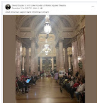
Rialto Square Theater.JPG 43K