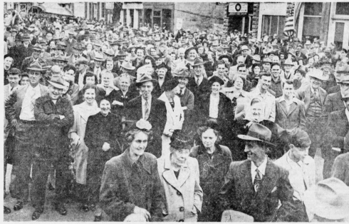
From the reviewing stand, this is the view of a small portion of the sea of humanity which swept Bainbridge Sunday for the third annual Open House and dedication of the Plant Value Show House, located on Station Two.