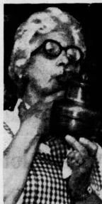
A member of the Ross County Senior Citizens Klubchen Band from Chillicothe blows a hot coffee pot in concert at Adelphi's Bologna Festival.

water fight between area firemen at 1:30 p.m. The Adelphi Band and the Gospel Crusaders will provide music.