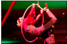
Amazing Portable Circus