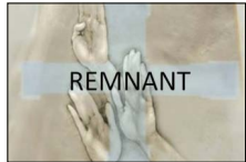
Remnant Expressive Signing