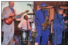
Inner City Blues Band