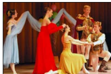
The Frog Prince Ballet