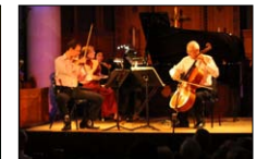
Chamber Music Classics