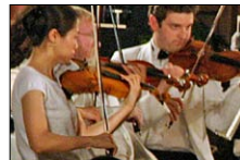
Festival String Quartet