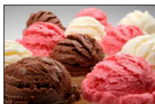
Ice Cream Social