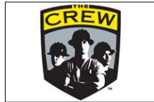
Columbus Crew Soccer Tour