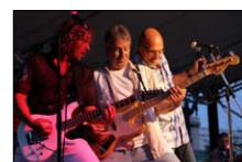
These Guys Live