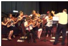
Sparrow Academy of Music