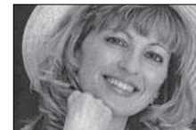
Celeste and Friends