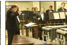
LHS Percussion Ensemble