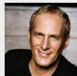
Michael Bolton Impressed With