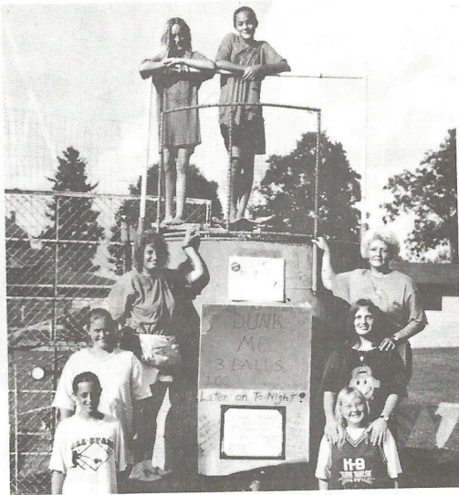
MEMBERS OF THE 1997 DUNK TANK CREW