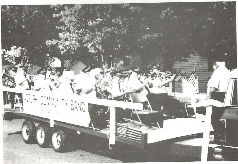
THE ADELPHI BAND