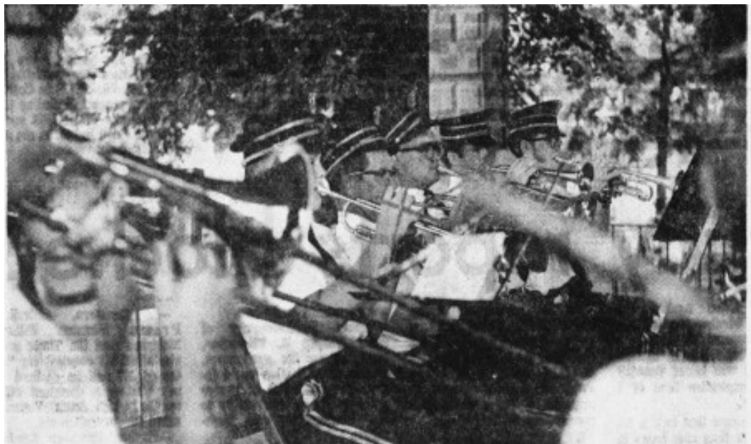
BAND CONCERT — The Adelphi Community Band, one of the few remaining groups of its type in the state, staged a concert Friday in the Yoctangee Park for those attending the groundbreaking ceremonies for the city's

This article has a great picture of the band playing in the park Bandstand.